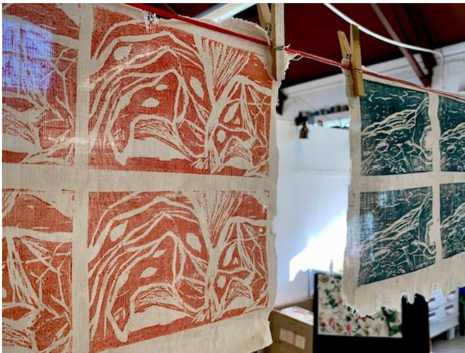
Sue's expressive linocuts, printed on linen, let the light in.