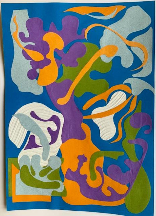
Paula's wonderfully animated collage.