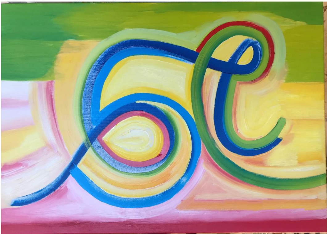
'Be'. Beautiful new painting by Akaash.