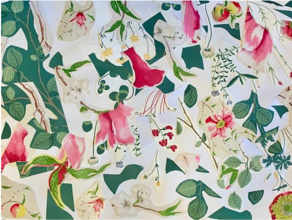
This delicate collage is the work of artist Susan.